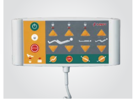
The Supervisor panel for nurses can lock the bed's functions and is equipped with pre-programmed functions.