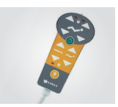
The patient and nurse hand control can adjust the position of bed's mattress platform and height.