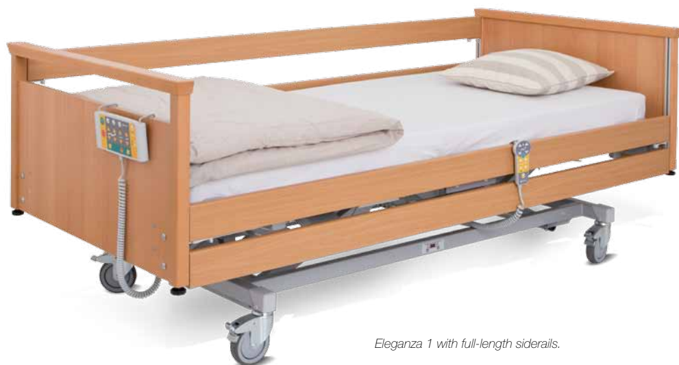
Eleganza 1 with full-length siderails.