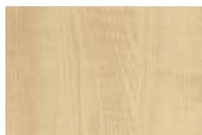
R 5184 Royal Maple

The colour scheme of the bed is highly variable and fully conforms to the environment of the specific facility. By choosing his own design and version the customer will acquire a functional and totally individual model.