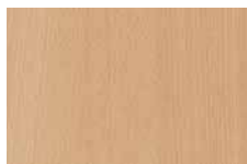
R 5320 White Beech