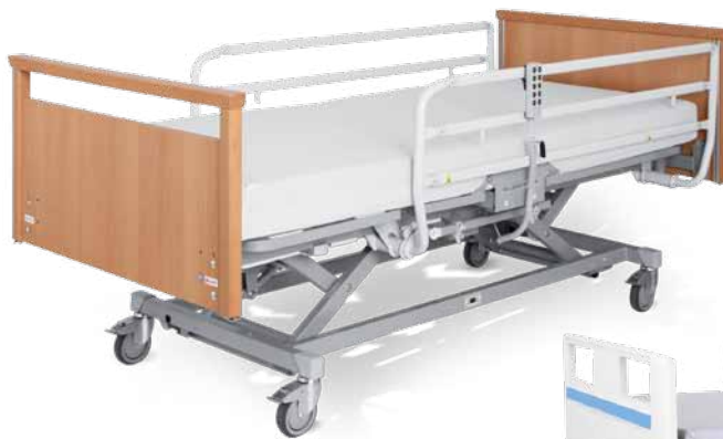
Eleganza 1 LE nursing version.