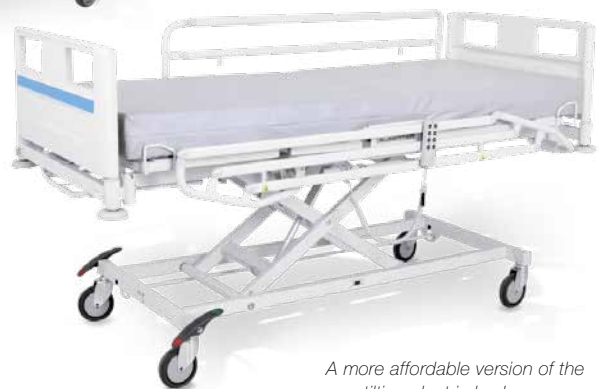
A more affordable version of the non-tilting electric bed.