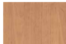
R 4601 Golden red Alder