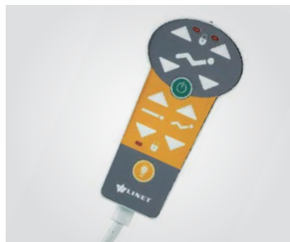
The patient and nurse hand control can adjust the position of bed's mattress platform and height.