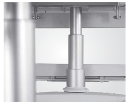
Smooth columns, jointless technology and practical construction make the bed easy to clean.