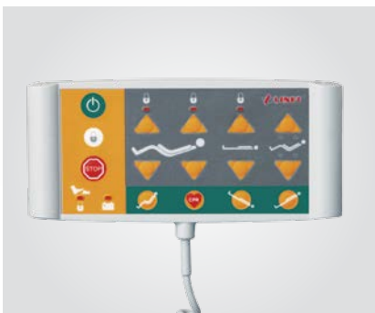
The Supervisor panel for nurses can lock the bed's functions and is equipped with pre-programmed functions.